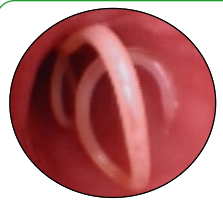
Roundworm in the intestine

Most puppies and kittens are born with worms, and people are familiar with the importance of treating for these internal parasites. Symptoms can be vague and mild, especially with minor infestations. However the range of worms seen across the UK is increasing, due to climate change, increased overseas travel, and changing life styles. These newer worms can cause more severe disease, and many can also affect people, so regular worm treatment is more important than ever.